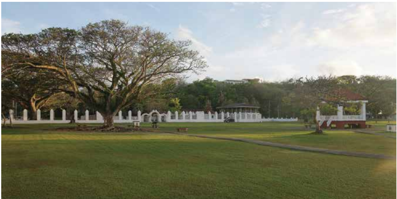
Plaza de Espana

The legislatures budget is a self-generating budget. It's source is the general fund of the Government of Guam to fund it's operations.